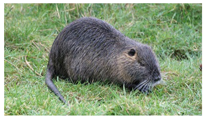
Nutria