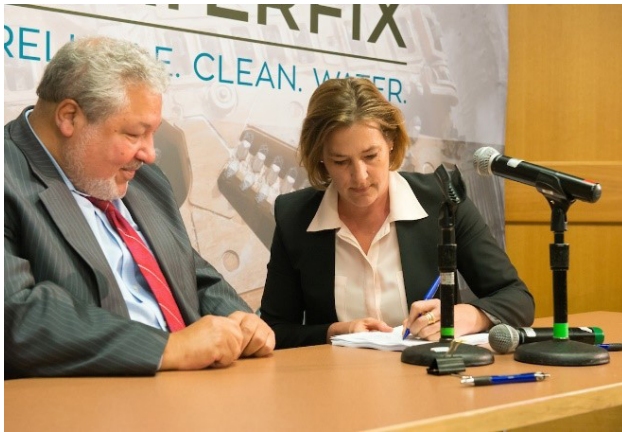
Joint Exercise of Powers Agreement is signed between DWR and the Delta Conveyance Design and Construction Authority.

In parallel, the State is well underway with implementation of California EcoRestore , which will advance restoration and enhancement of at least 30,000 acres in the Delta by 2020. In 2018, construction began on four projects that will restore more than 3,000 acres of tidal and floodplain habitat. In addition, construction began on the Fremont Weir Adult Fish Passage Project to significantly improve fish passage for adult salmon and sturgeon. A first-of-its-kind request for proposal mechanism was developed for the DWR Fish Restoration Program , securing 480 additional acres of tidal habitat through contracts for turnkey restoration projects.