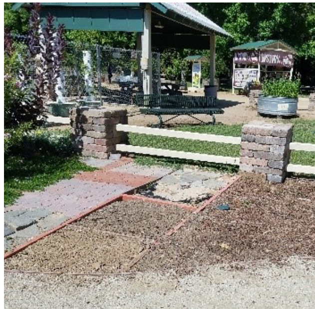
Turf replacement demonstration garden in the 2018 Save Our Water campaign.

The California Energy Commission (CEC) has embarked on a number of water- and energy-efficiency projects related to agricultural and winery operations, cooling towers, and leak detection. CEC is also developing water and efficiency standards for spray sprinklers, irrigation controllers, and tub-spout diverter.