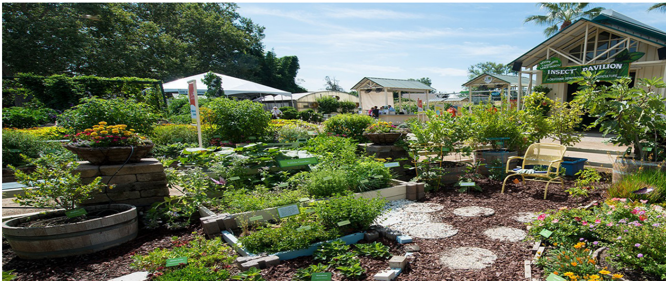
DWR’s colorful Water-Wise Garden, as part of the department’s “Water Conservation: Rain or Shine” exhibit at the 2017 California State Fair, encouraged an estimated 635,000 fairgoers to continue a lifestyle of conservation.

These new laws provide complementary authorities and requirements for State agencies and water suppliers. The legislation will transform State water conservation requirements by focusing on efficient water use, while accounting for unique climatic, demographic, and land-use characteristics of each water supplier’s service area. As an initial action to assist local and regional entities with implementation of the legislation, the California Department of Water Resources (DWR) and the State Water Resources Control Board (State Water Board) released a draft primer on the water conservation and drought planning