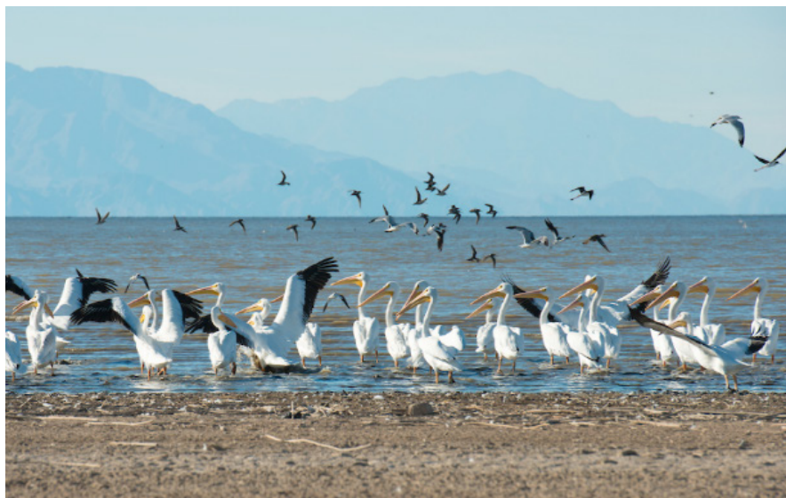
White pelicans congregate on the Salton Sea's slowly receding shores. Throughout 2018, the State continued work on habitat restoration, air quality, and water supply projects to protect the sea's future.

Significant growth in commercial cannabis cultivation following adult use legalization led the Water Board, in 2017, to adopt a new Cannabis Cultivation Policy . Left unchecked, cannabis cultivation poses serious threats to water quality and fish and wildlife by diverting water or releasing fertilizers, pesticides, and sediments into waterways. The new policy establishes strict protections for riparian areas and wetlands and protects stream flows from contamination and over diversion of water.