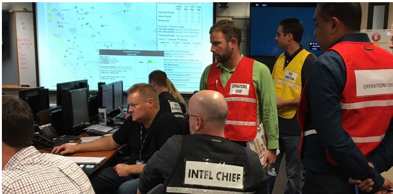
The State-Federal Flood Operations Center is activated during the extreme winter storms of 2017.

Significant progress also has been made to improve the State’s approach to dam safety. Consistent with legislation enacted in 2018, DWR’s DSOD is consulting with independent dam safety and dam safety risk-management organizations to propose changes to DSOD’s existing dam safety program to ensure public safety. DSOD will be consulting with a team of 14 dam safety and risk experts from USACE, the U.S. Bureau of Reclamation (Reclamation), the Association of State Dam Safety Officials, and the United States Society on Dams to implement risk-informed decision-making into its Dam Safety Program to increase operational and regulatory efficiency.