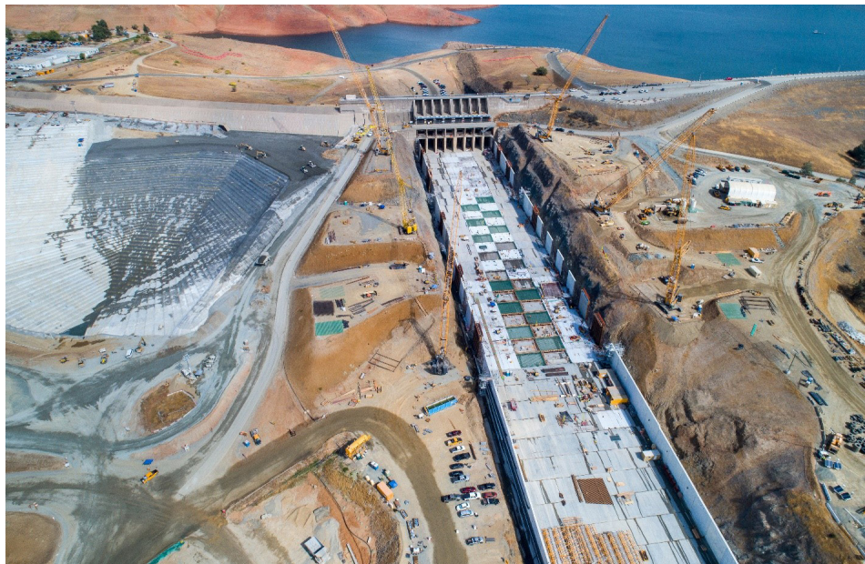
Starting in May 2017, DWR and its construction contractors began repairing and rebuilding Oroville’s main and emergency spillways. As of November 1, 2018, the main spillway was successfully reconstructed, meeting DWR’s public safety construction milestone.

Through the California Silver Jackets (a collaboration among multiple partner agencies), DWR led the seventh annual statewide Flood Preparedness Week, which focused on the constant message of “Be Aware. Be Prepared. Take Action.” In 2018, the two specific themes were high-water mark and flood after fire. This joint effort encouraged local communities to organize flood awareness events, adopt resolutions and proclamations, disseminate social media messages, and help Californians become better prepared for flood disasters.