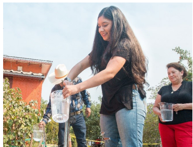
In East Porterville, three State agencies —DWR, State Water Board, and Governor’s Office of Emergency Services — partnered with the City of Porterville, other Tulare County agencies, and local non-government organizations to deliver a permanent solution to the water woes of East Porterville.

The CEC has initiated a novel low-energy biofiltration treatment system for groundwater contaminated with nitrate and perchlorate, which can generate safe potable water for communities. The project has been allocated $1.7 million and is scheduled to be completed in 2020.