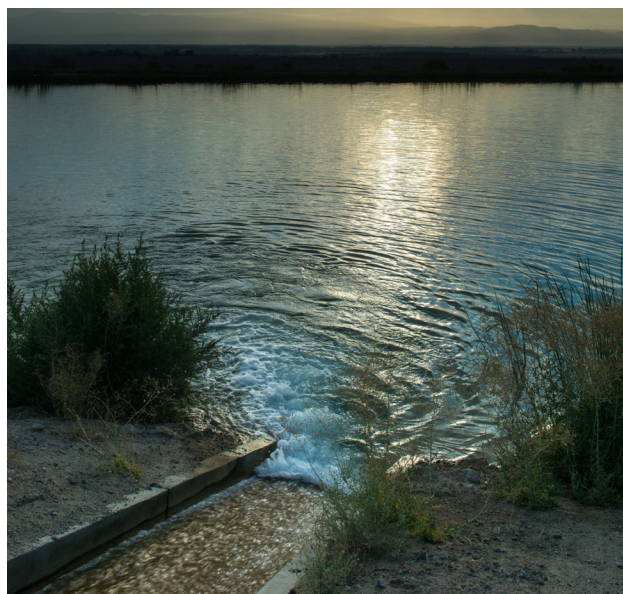
Coachella Valley Water District's Thomas E. Levy Groundwater Replenishment Facility in Coachella, California, percolates imported Colorado River water into the eastern subbasin of the Coachella Valley's aquifer.

The Water Board issued temporary water rights permits for groundwater recharge to assist project applicants in their efforts to increase aquifer storage and optimize surface and groundwater storage.