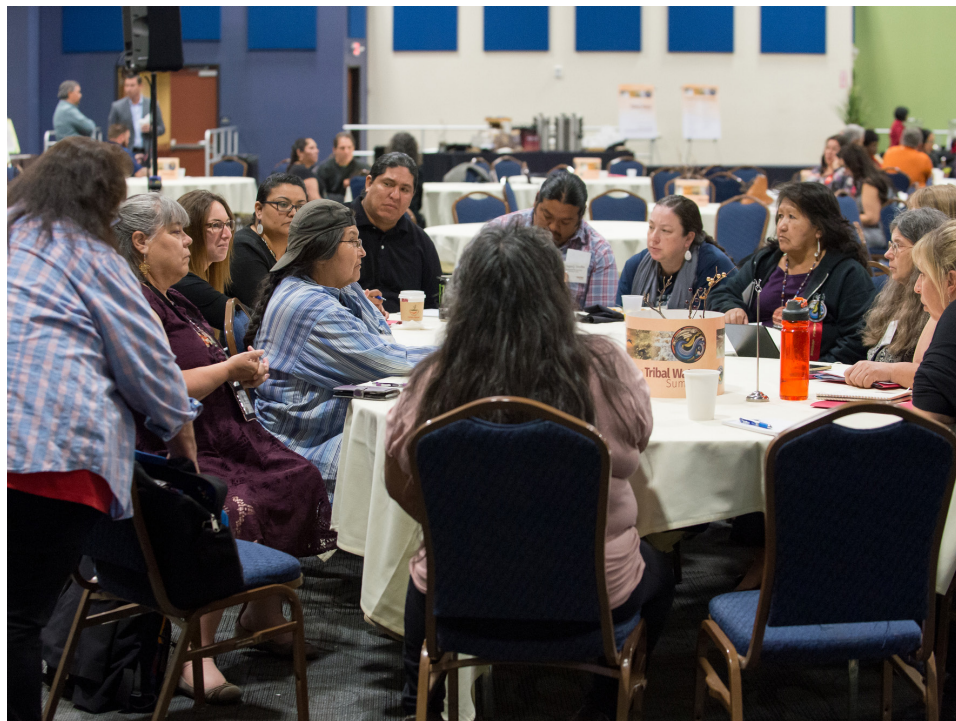
The April 2018 Tribal Water Summit addressed indigenous water rights and explored further partnerships to meet tribal water policy needs.

In consultation with the California Air Resources Board, DWR completed agreements for 13 projects funded through the Greenhouse Gas Reduction Fund . These projects are designed to reduce water use by 45,600 af and lower GHG emissions by an estimated 574,000 metric tons.