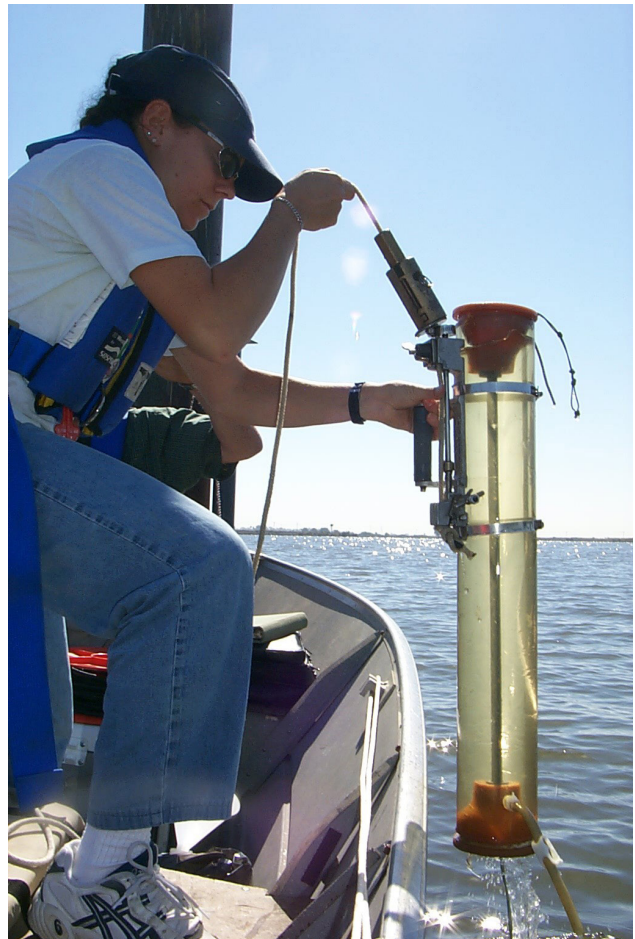
The Delta Stewardship Council adopted its Science Action Agenda to focus and coordinate high-priority science investigations — including water quality monitoring — across multiple State and federal agencies.

The CEC is working on a proof-of-concept study to evaluate the feasibility of using groundwater storage and cycling surface reservoirs to shift the SWP's Southern California water deliveries to non-summer months. The main goal is to reduce electric grid demand during the summer.