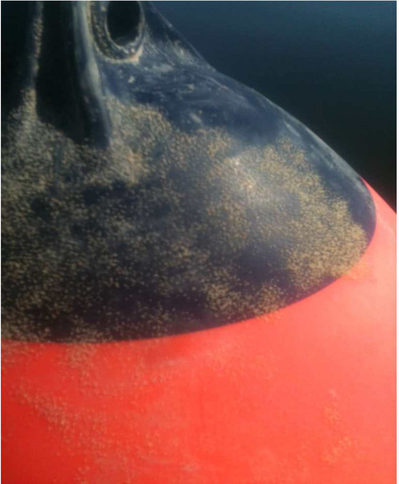
Photograph 1 Barnacle colonization on float