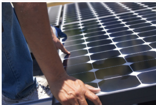
Figure 9.1 California needs a skilled workforce to actually get climate-safe infrastructure appropriately designed, built, operated and maintained. (Photo: Solar installer lays a photovoltaic module)

Over the course of the CSIWG's work, a reoccurring theme was the need to have the skilled workforce to actually get climate-safe infrastructure appropriately designed, built, operated and maintained. This is far from a new theme in infrastructure discussions, neither in the state [187,296,297] , nor across the nation [188,189, 192,193,223] . But with regard to the central concern of this report, namely how to account for climate change in infrastructure engineering, the workforce issues take on a unique flavor.