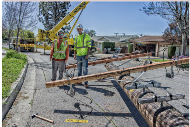
Figure 9.2: Workforce development must reach into all segments of California society, and particularly open doors to minority, women and otherwise previously disadvantaged workers. (Photo: Workers erecting a telephone pole; Russ Allison Loar, flickr, licensed under Creative Commons license 2.0)