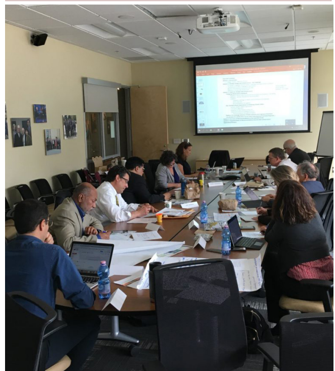
Figure 9.3: The role of a future Standing Climate-Safe Infrastructure Working Group would be to coordinate infrastructure-related efforts across State agencies, provide a central point of contact and forum for learning and exchange, and provide leadership in implementing the recommendations of this report

The Climate-Safe Path for All is thus not a new or extra process that communities or State agencies must understand and subsequently align with other State policies. It is not another series of meetings that are to be added to already overcommitted schedules. It should certainly not be another unfunded mandate. Rather, the Climate-Safe Path for All is intended to serve as the vision for connecting all of the State’s disparate, but ultimately interconnected, climate adaptation and mitigation actions on infrastructure and related systems. It also prominently integrates the importance of social equity across these efforts and gives it a central and coherent place.