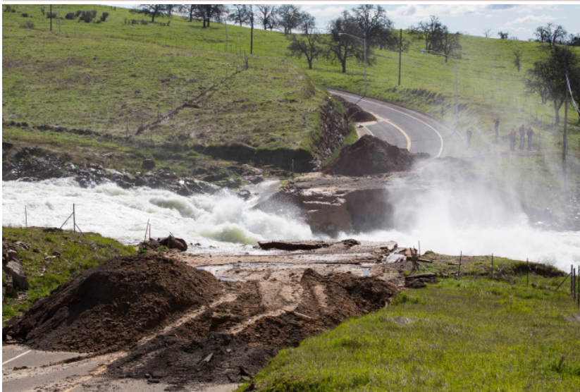
Figure 9.6 In a crisis, expedited permitting is crucial, but rebuilding with climate change in mind must become part and parcel of permitting and waiver guidance. (Photo: Bonds Flat Road near the Don Pedro Dam spillway, February 23, 2017; Dale Kolke, DWR, used with permission)