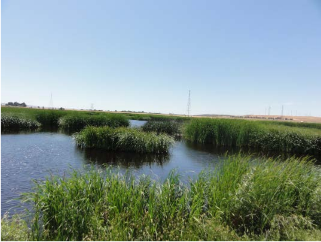
Wetland Restoration after construction (Summer-2014)