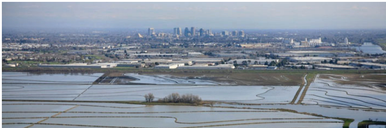
Yolo Bypass

Accomplishing the array of discrete actions articulated in the Action Plan requires a significant new investment of public resources, as well as state agency alignment and oversight, and a concerted focus on outcomes. In addition, continued support by the Legislature and the public is required for the many water-related efforts not explicitly referenced in the Action Plan (e.g. the measurement, analysis, integration, and sharing of essential water management data). Additional resources are needed (to replace funding provided in the past by general obligation bonds) for DWR to prepare the five-year updates to the California Water Plan as required by the California Water Code and depended on by water managers across the state. While not described explicitly in the Action Plan, these types of state services are foundational to its success.