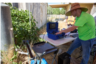
Analysis of existing well condition using downhole video log and pump testing