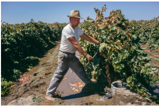
Needs assessments for small farmers