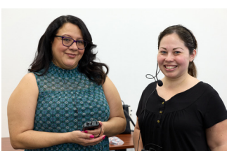
Coordination and facilitation on Groundwater Sustainability Agency (GSA) matters

For questions or TA Services, please call 805.308.8531 or email URCTA@water.ca.gov