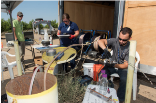
Groundwater level monitoring, including instrumentation installation and training