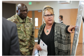
Support on the preparation and submittal of applications and other documents