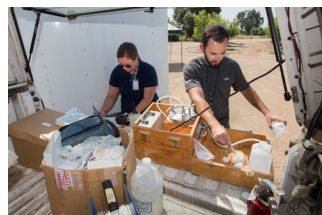
Groundwater quality testing and treatment