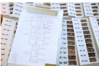
Analysis of well interference