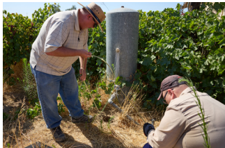
Aquifer testing to determine long-term yield and supply