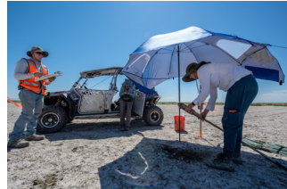
Soil moisture monitoring