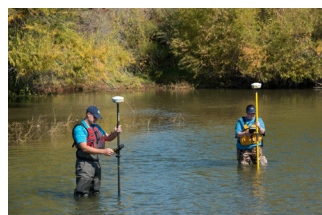
Groundwater impact analysis (for depletion, land subsidence, Groundwater Dependent Ecosystem [GDE] depletion, etc.)