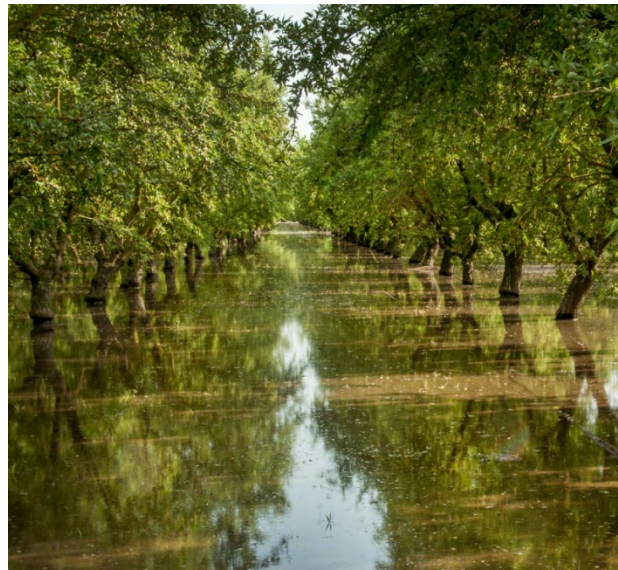
Figure 2. Example of orchard utilized as Flood-MAR facility (DWR, 2018).