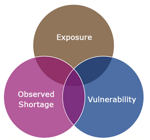
Figure 1-1. Groupings of Indicators (components) Used to Estimate Drought and Water Shortage Risk for Small Water Systems and Self-Supplied Communities (exposure, vulnerability, observed shortage)

We developed a framework for examining risk using the risk and vulnerability concepts described in the Intergovernmental Panel on Climate Change IPCC (Cardona et al. 2012) and the World Risk Reports (Garschagen et al 2016; IFHV 2018). Small suppliers and self-supplied households in California have varying degrees of exposure to hazardous events and conditions. We account for current and recent hazards as well as future hazards projected to occur with the changing climate (Exposure in Figure 1-1). Each also has a unique set of sensitivities and adaptive capacities that make it more or less vulnerable to this exposure (Vulnerability in Figure 1-1).