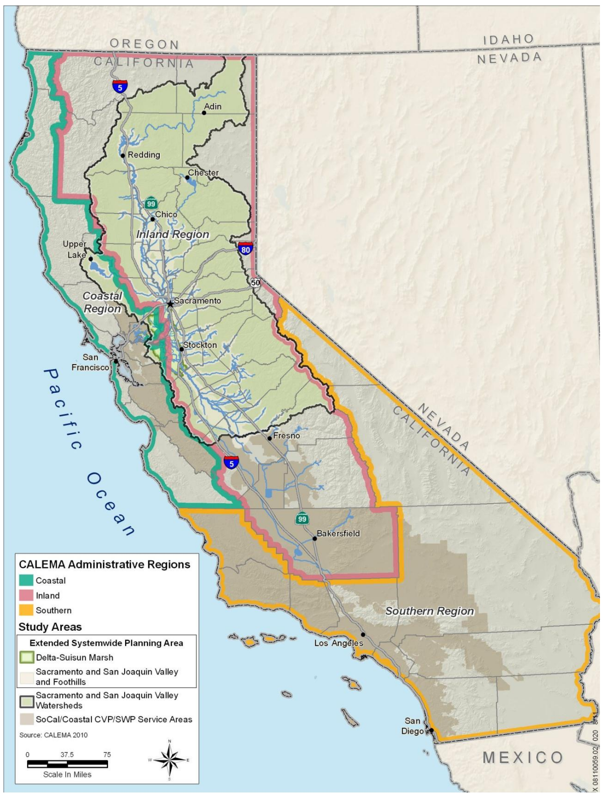
Figure 3.17-2. The California Emergency Management Agency's Administrative Regions for Emergency Services