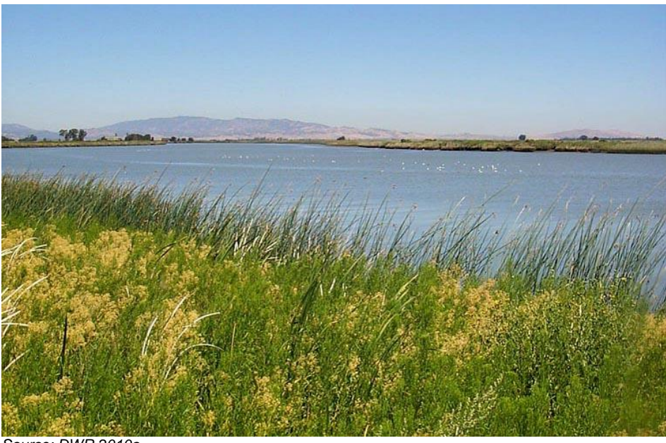
Figure 3.2-3e. Representative Photograph of the Sacramento and San Joaquin Valley: Arroyo Canal