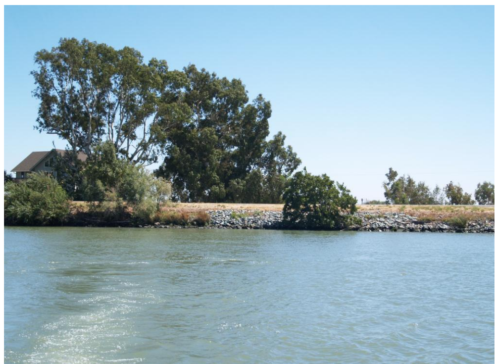
Figure 3.2-3g. Representative Photograph of the Delta–Suisun Marsh: Views near a Delta Slough

The valley consists largely of material eroded from the Sierra Nevada to the east or the Coast Ranges to the west, deposited in low alluvial fans. The valley floor is cut by rivers that flow westerly out of the Sierra Nevada and easterly out of the Coast Ranges. Two main drainages run the length of the valley: the Sacramento River originates in the Cascade Range at the northern end of the Sacramento Valley and flows south into the Delta from Shasta County; the San Joaquin River originates in the Sierra Nevada in Fresno County and flows westerly, then to the north into the Delta. Bluffs formed as the rivers meandered across the flat valley.