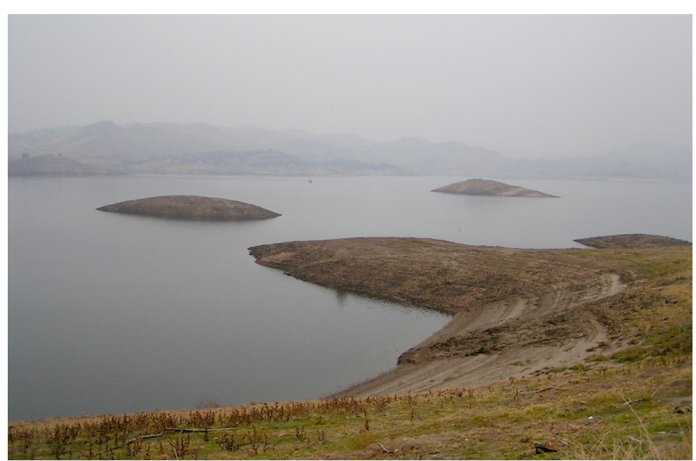
Figure 3.2-3a. Representative Photograph of the Sacramento and San Joaquin Valley Foothills: South Fork of the Yuba River in the Sierra Nevada Foothills