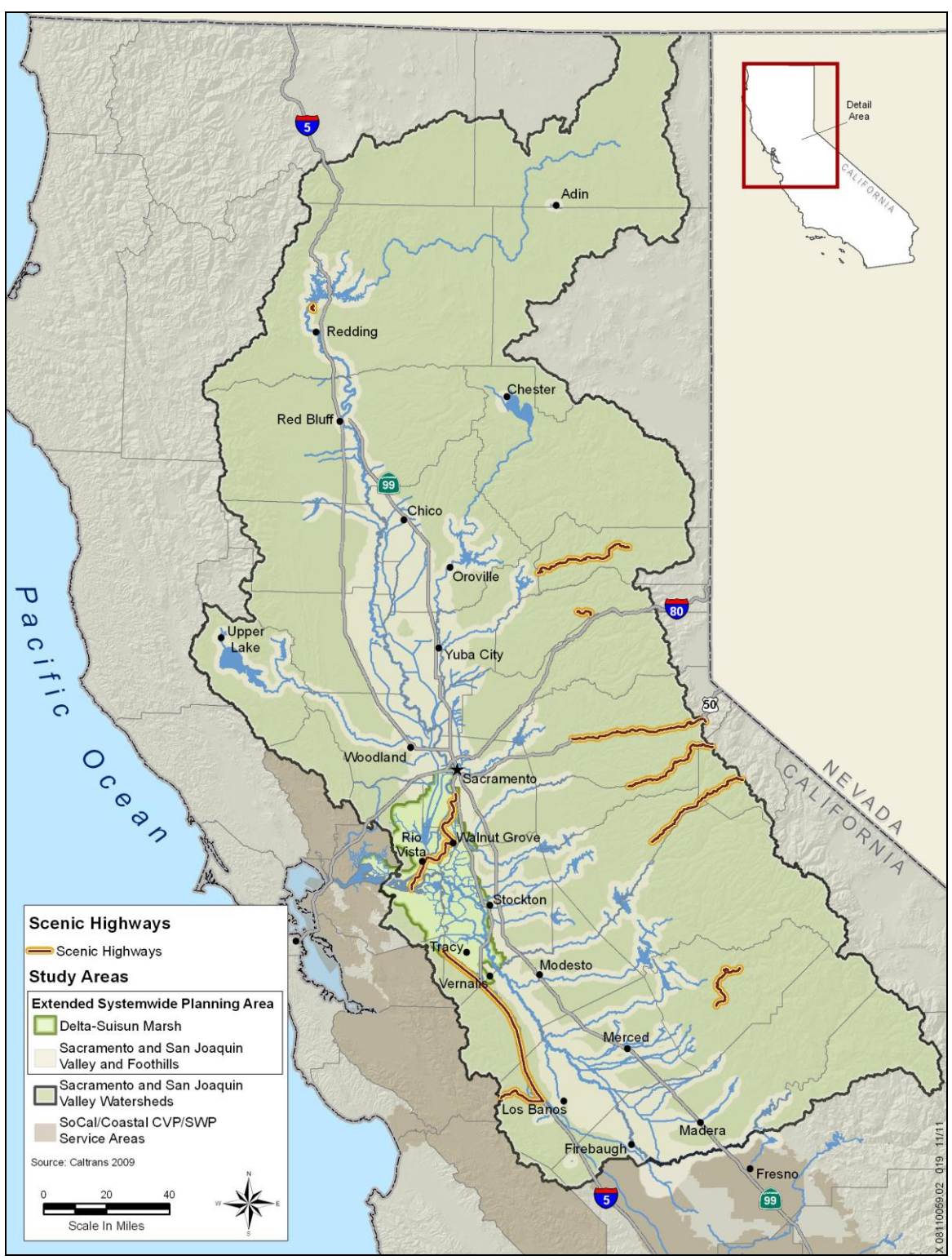
Figure 3.2-1. State-Designated Scenic Highways in the Extended SPA and the Sacramento and San Joaquin Valley Watersheds