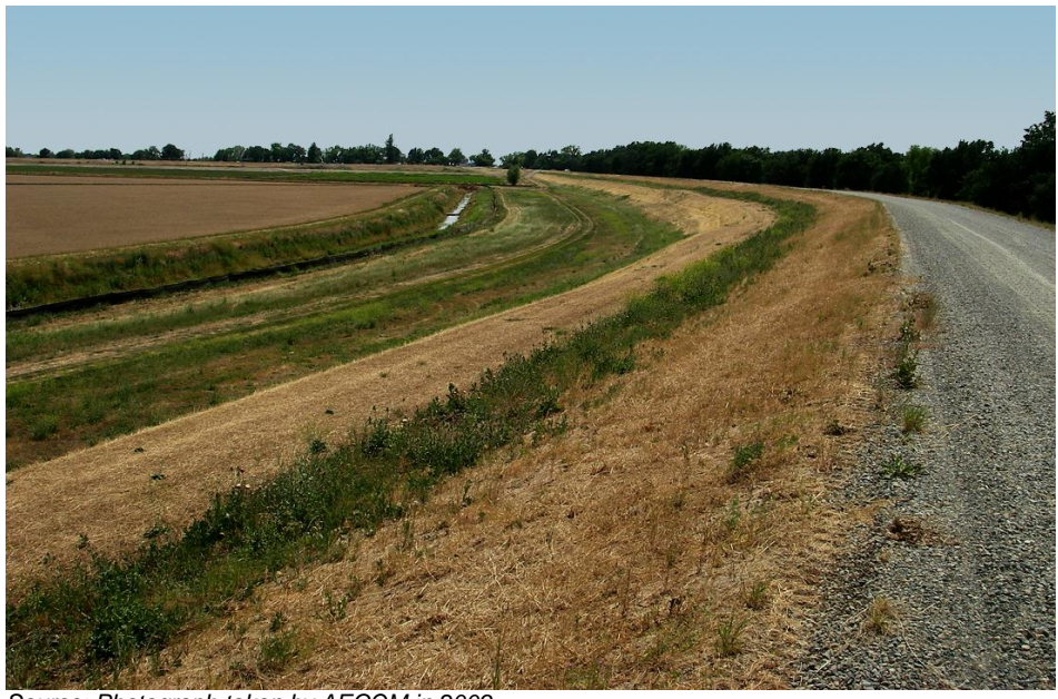
Figure 3.2-3c. Representative Photograph of the Sacramento and San Joaquin Valley: Streamside Vegetation along the San Joaquin River