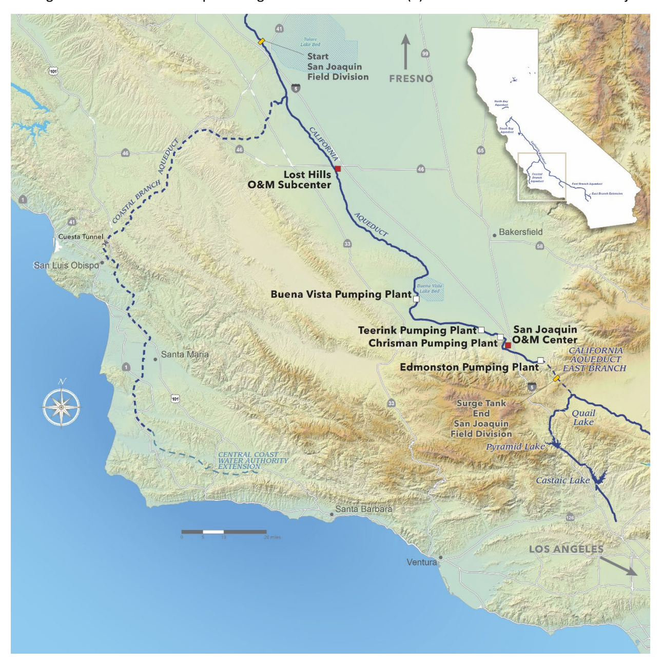
Figure 2-1: SJFD Program Location Map