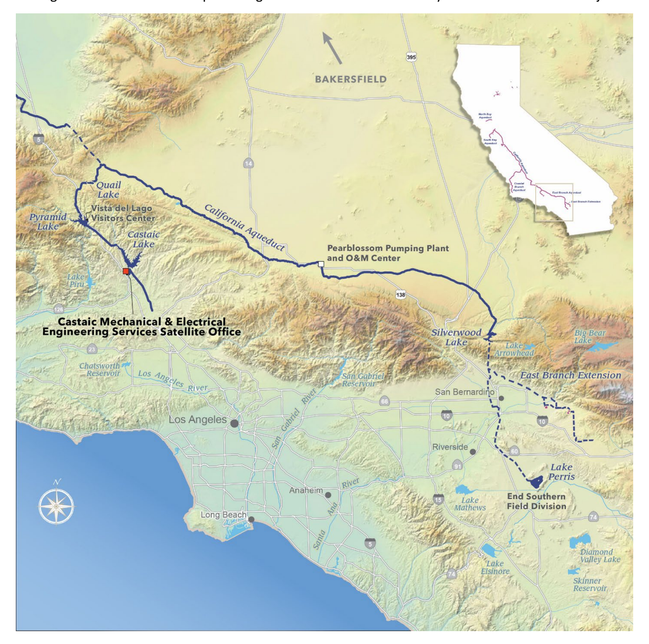
Figure 2-2: SFD Program Location Map