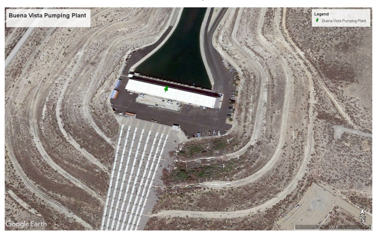
Figure 2-8: Buena Vista Pumping Plant

The Buena Vista Pumping Plant (Figure 2-8 below) was constructed between 1967 to 1972 and is located on the California Aqueduct about 24 miles southwest of Bakersfield in Kern County. The plant operates in a series of sequential lifts in southern San Joaquin Valley with Chrisman, Edmonston, and Teerink Pumping Plants to convey California Aqueduct water to and across the Tehachapi Mountains. The Buena Vista Pumping Plant provides the first lift from an elevation of 295.4 to 500.6 feet. The plant also furnishes water for the turnouts in the reach of aqueduct between itself and Teerink. Buena Vista is a four-level facility (one level above ground and three levels below ground) and approximately 80,000 SF. It has a reinforced-concrete substructure and structural-steel superstructure.