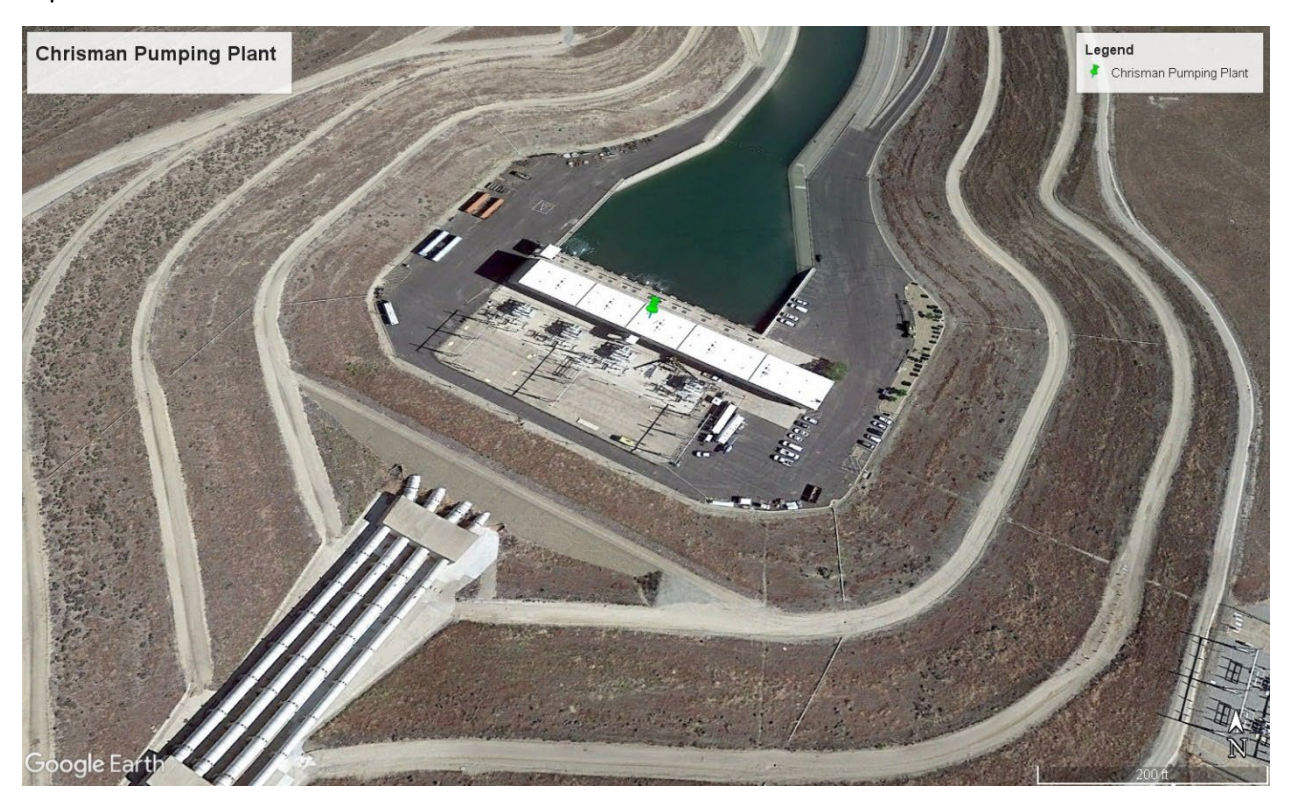
Figure 2-5: Chrisman Pumping Plant Location Map

A mostly underground pumping facility, Chrisman was constructed from 1966 to 1973 and has nine pumping units with a total design flow of 4,400 cubic feet per second (cfs). Chrisman is a five-level facility and is approximately 74,000 SF. It has a reinforced-concrete substructure and structural-steel superstructure.