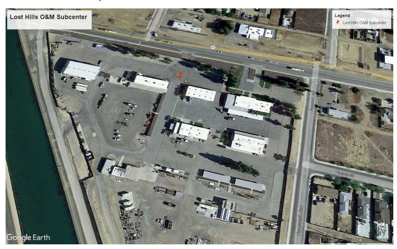
Figure 2-4: Lost Hills O&M Subcenter

The Lost Hills O&M Subcenter (Figure 2-4 below) is comprised of six (6) buildings that include, but are not limited to: administration offices, material warehouse, equipment storage, vehicle storage, facility water treatment, and mobile equipment repair. They range in size from approximately 2,700 SF - 5,300 SF and were built in the late 1960's. The buildings are primarily constructed with block exterior walls with drywall and metal frame interior partition walls.