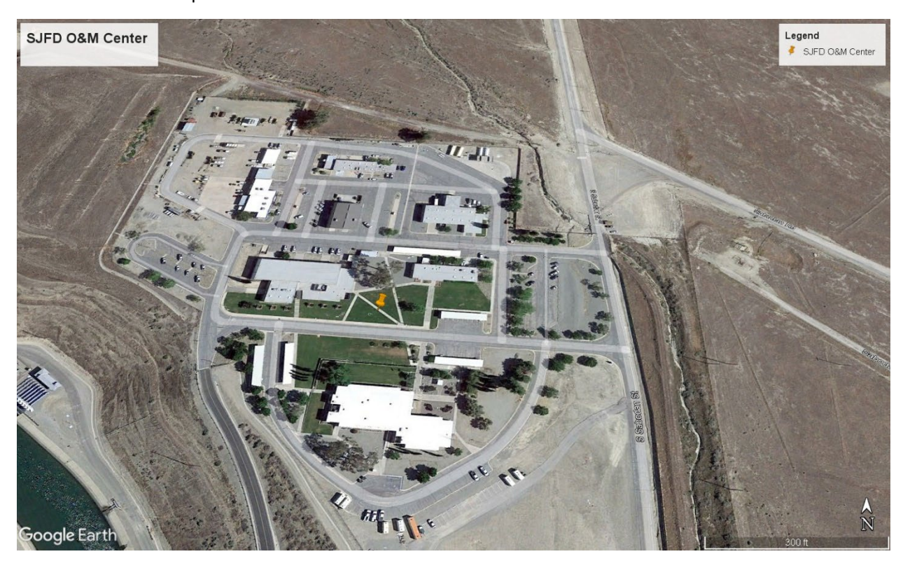
Figure 2-3: SJFD O&M Center

This SJFD O&M Center (Figure 2-3 below) is comprised of eight (8) buildings that include, but are not limited to: administration offices, maintenance office and shop aeras, training, material warehouse, and mobile equipment repair. They range in size from approximately 4,900 square feet (SF) - 27,000 SF and were built in the 1960s. The buildings are primarily constructed with block exterior walls with drywall and metal frame interior partition walls.