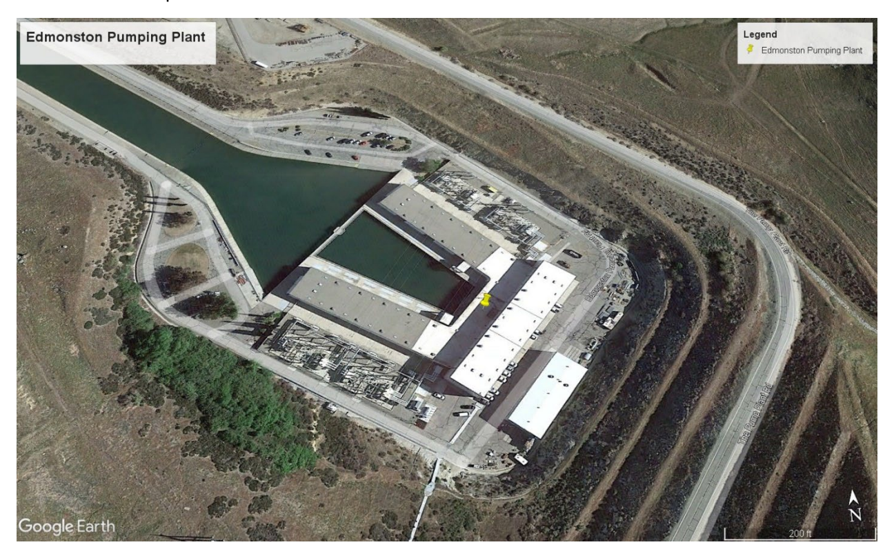
Figure 2-6: Edmonston Pumping Plant

Completed in 1974, the plant has fourteen pumping units and two motor-generator sets used for pump starts. Edmonston is mostly an underground pumping facility divided into a West Wing and an East Wing, with the control room, maintenance lay down area (service bays), and former visitors' facilities located in a center spine between the two wings. Edmonston is a six-level facility (one level above ground and five levels below ground) and is approximately 222,000 SF. It has a reinforced-concrete substructure and structural-steel superstructure.