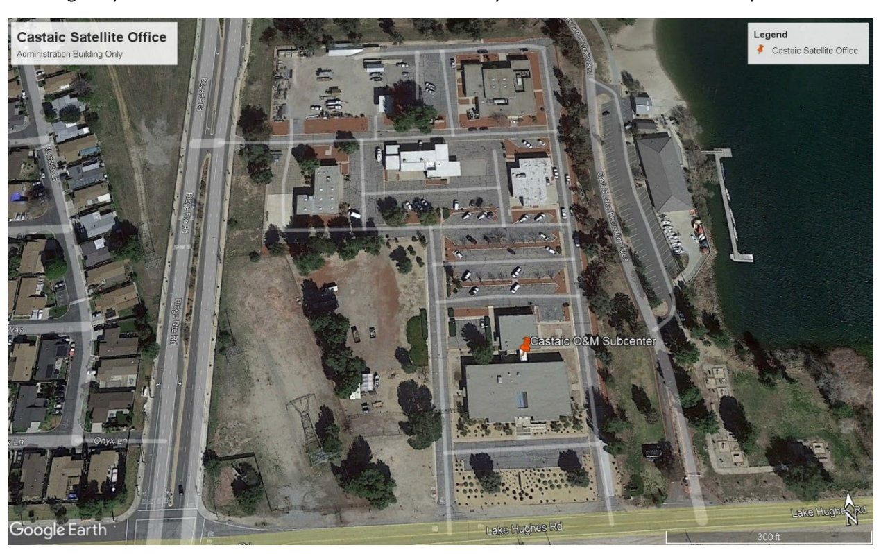
Figure 2-9: Castaic O&M Subcenter

The Castaic O&M Subcenter (Figure 2-9 below) is a muti-building facility; however, this project is focusing on the administration office Building only. It is approximately 14,000 SF and was built in 1967. The building was originally constructed with block exterior walls with drywall and metal frame interior partition walls.