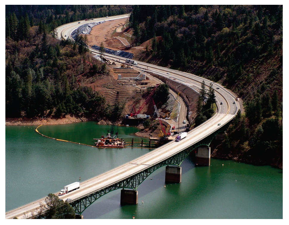
Photo 1 Caltrans I-5 Antlers Bridge Realignment Project on Shasta Lake