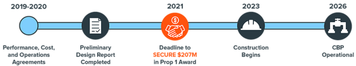
Figure 3-1. Simplified CBP Schedule

CBP milestones leading up to the Commission’s Water Storage Investment Program (WSIP) conditional funding award date are shown on Table 3-1 .