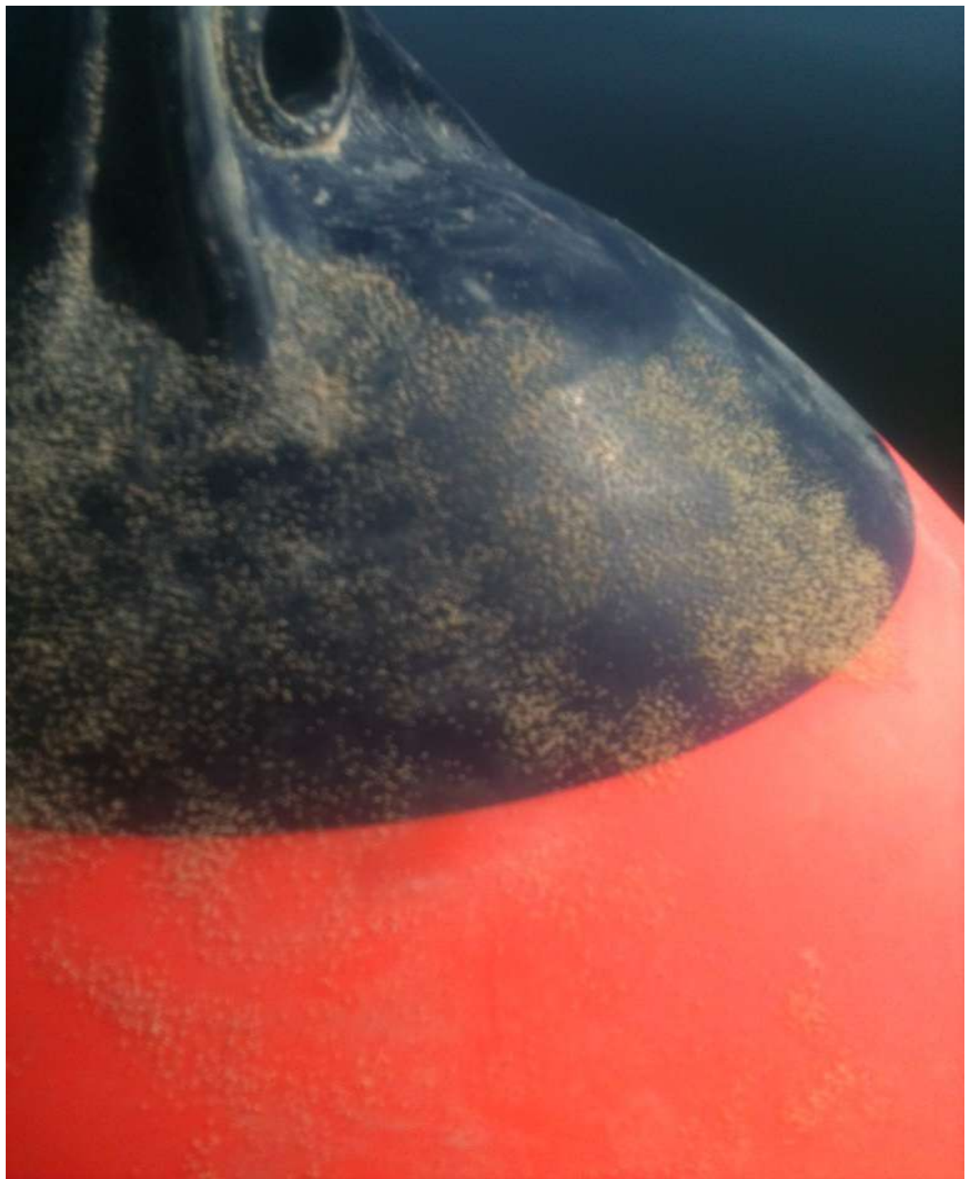
Photograph 1 Barnacle colonization on float