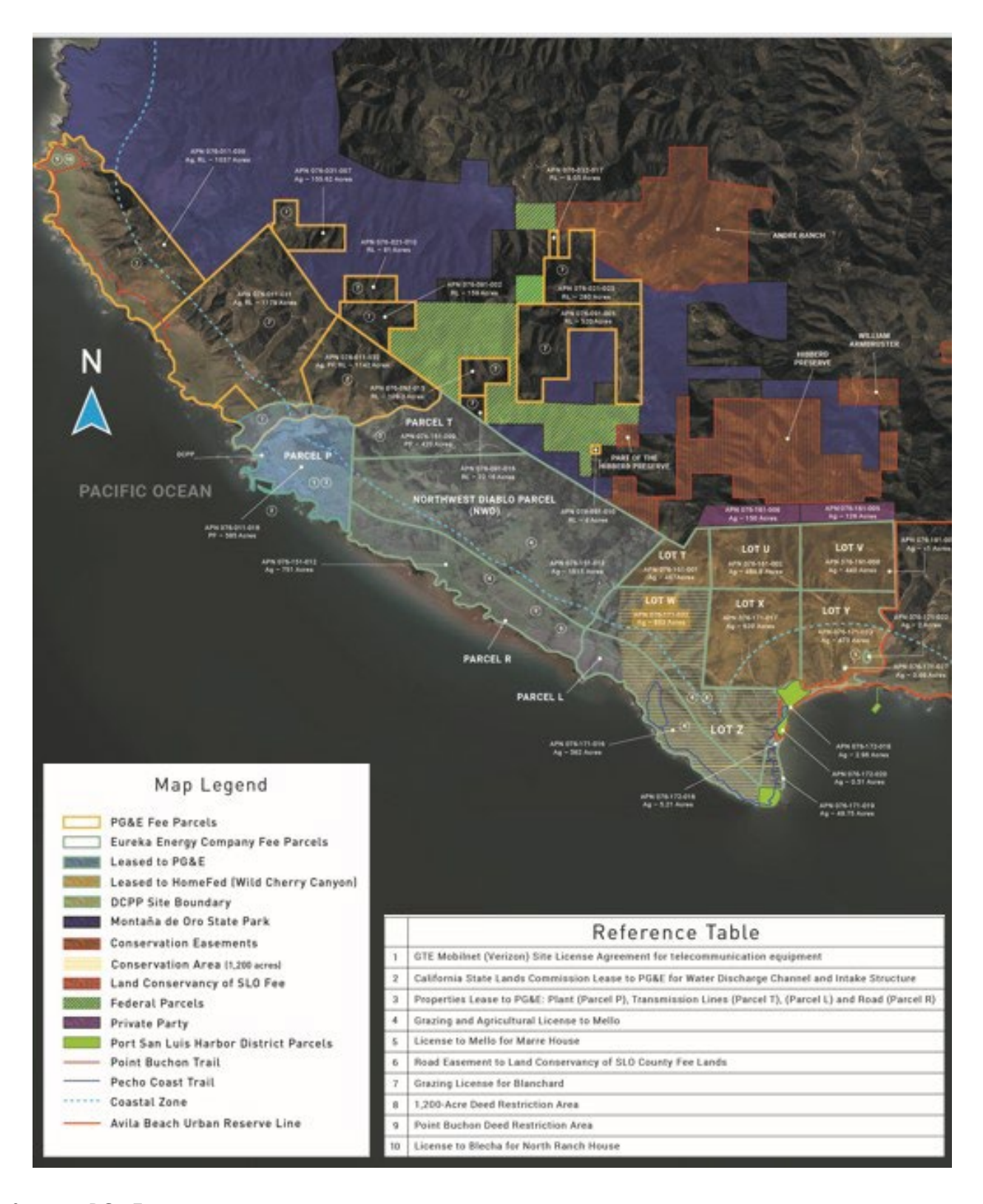
Figure 2: Diablo Canyon Land Ownership