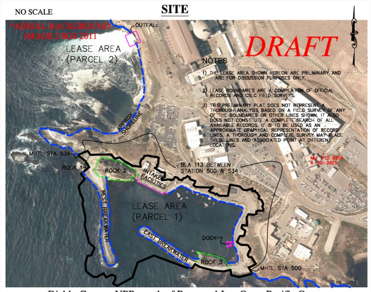
Diablo Canyon NPP, south of Baywood-Los Osos, Pacific Ocean