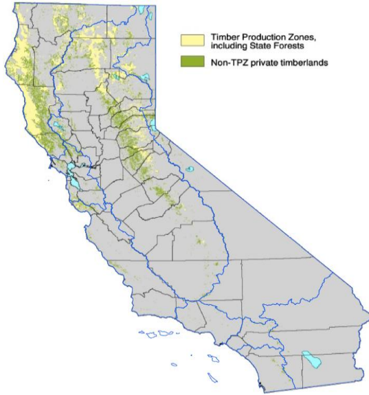
Legend - Timber Production Zones, including State Forests - Non-TPZ private timberlands