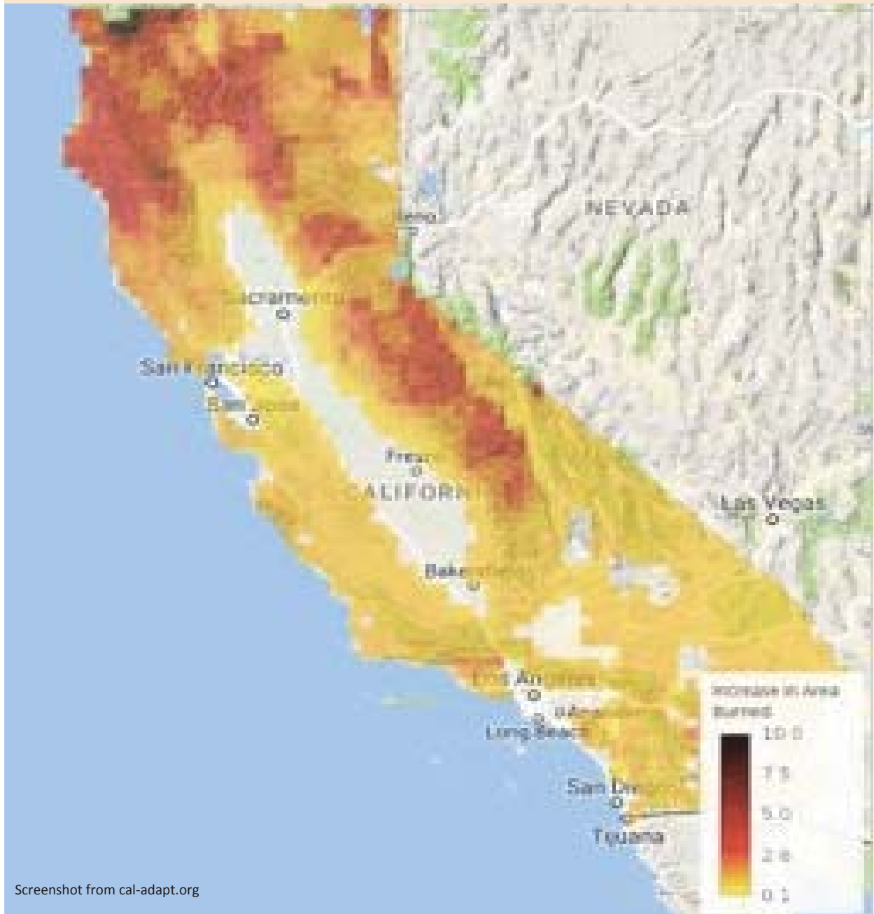
Screenshot from cal-adapt.org

Cal-Adapt is an online, interactive, visualization tool that enables researchers, decision makers, and the general public to explore how climate change will impact specific regions in California. A recommendation in the 2009 California Adaptation Strategy to support local decision-makers and planners in identifying, understanding, and adapting to climate risks spurred the creation of Cal-Adapt. Current research projects are launching updates to 1) climate change visualization tools and data (projected as well as historical) hosted on Cal-Adapt, 2) migrate Cal-Adapt to an open source Application Programming Interface (API) that supports third-party tool development, and 3) implement concerted outreach efforts to ensure that results reach target audiences in the electricity sector and are responsive to their needs.