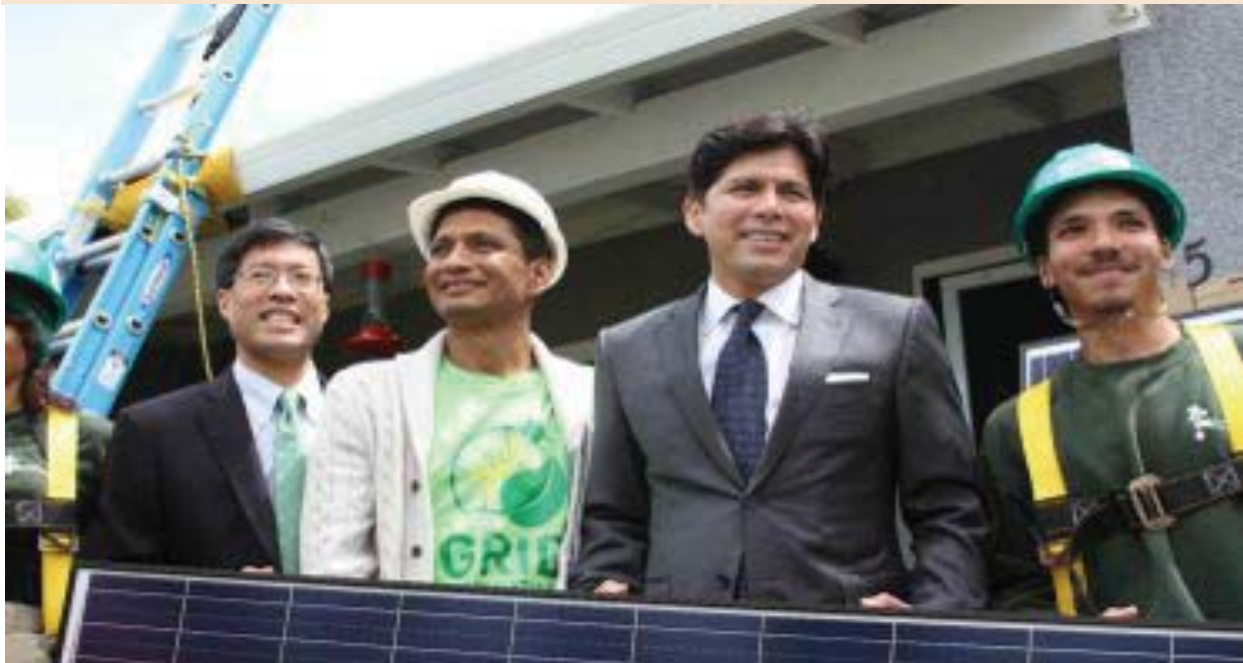
Senator Kevin De León (second from right) at a LIWP solar installation in Sacramento. He is flanked by the homeowner, left and a job trainee, right.

The Single-Family Affordable Solar Homes (SASH) program provides direct funding for solar installations in low-income communities in California. Administered by nonprofit GRID Alternatives, it provides up-front rebates to help low-income homeowners served by investor-owned utilities access the benefits of solar power, with integrated workforce development opportunities. The program was created by Assembly Bill 2723, which directed that a minimum of 10% of California Solar Initiative funds be set aside for programs assisting low-income households in investor-owned utility service territories. Funding for the program was extended in 2013. Over 6,800 low-income households have received solar power through the program to date.