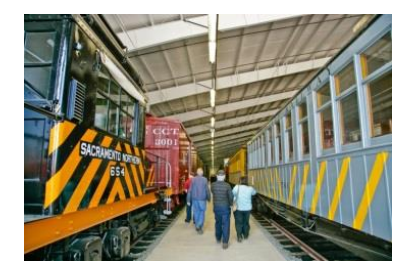
Western Railway Museum

Unless otherwise stated, the terms used in these Grant Guidelines, Application & Forms, have the following meanings for purposes of this program, per Education Code Section 20050-20091.