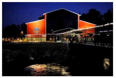
Tulare County Museum